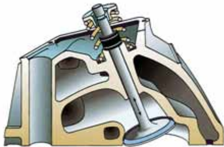
Positive seals attach to the valve guide boss. They work like a squeegee, wiping and metering oil on the stem as it passes through the seal.

There are two basic valve stem seal designs: deflector (umbrella) seals and positive seals.